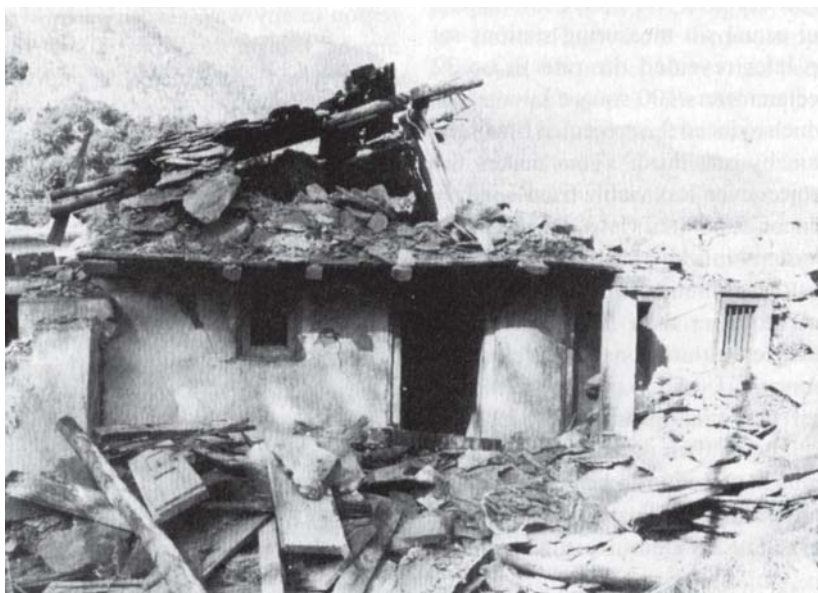
Aftermath of Tehri earthquake 1991

The Tehri dam project builders claim that it will irrigate 2.7 lakh hectares of land and generate 1,000 MW in Stage I, 1000 MW in Stage II, and 400 in Stage III — a total of 2,400 MW of power. However, we know from previous government projects that no power plants built under government control ever function as planned. Most of them are run so inefficiently that they don't even yield 25 percent of their installed capacity. Many independent scientists believe that under the best of circumstances, the project will not generate more than 350 MW of power and this pitiful amount of electricity can easily be produced through the use of much less invasive technology and at much lower costs. Similarly, 2.7 lakh hectares can more efficiently be irrigated through a variety of medium and small scale irrigation projects. Tehri dam was conceived in 1949 when 350 MW of energy potential seemed a lot. However, in today's context to take such enormous risks for this amount of electricity is absurd especially