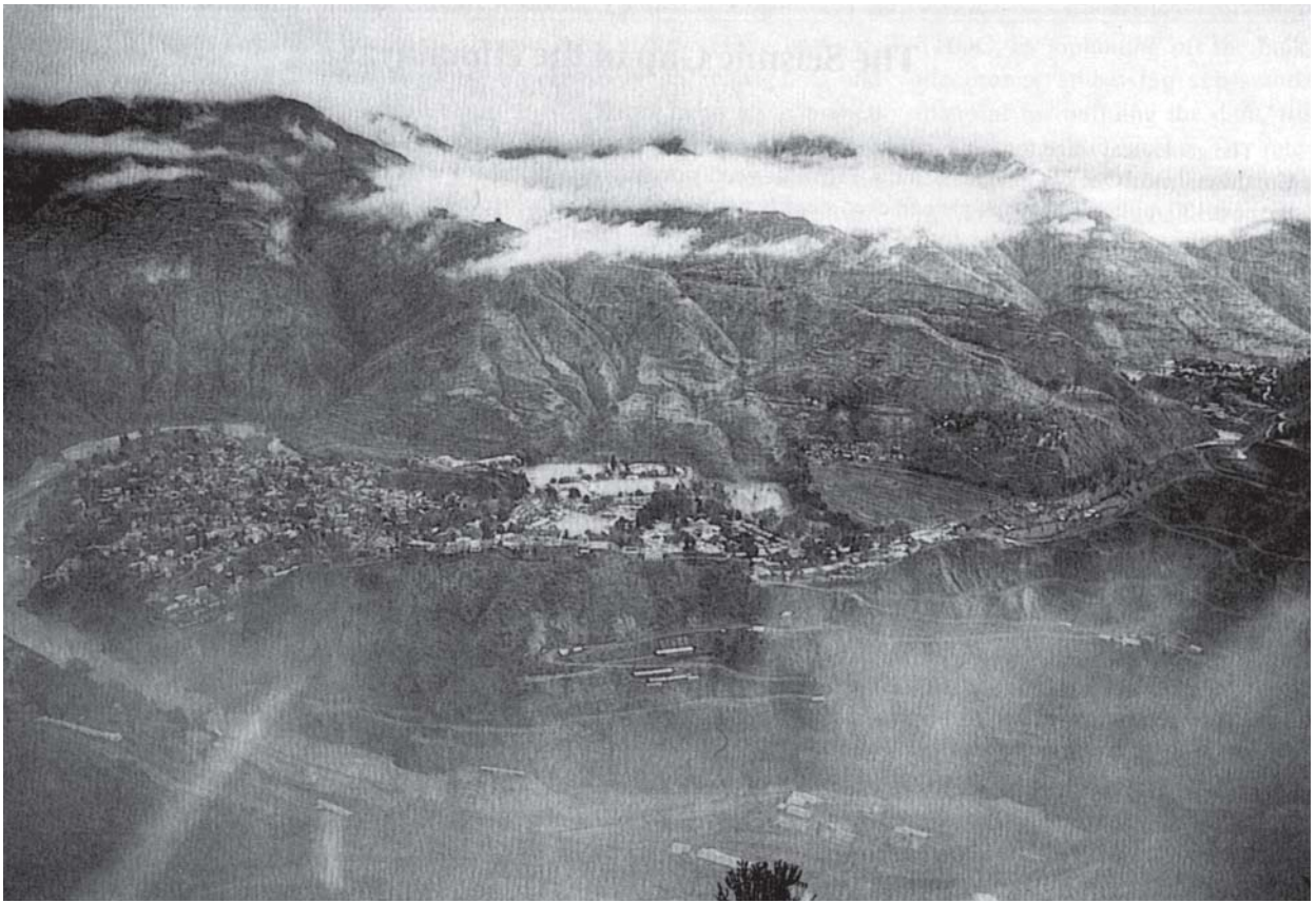
A long shot of Tehri town, Bhagirathi river and the dam site, Photo: RAGHU RAI

ensure proper rehabilitation and compensation for nearly a lakh of people who will be forever uprooted from their villages and homes on account of the dam, with little hope of rehabilitation, as no alternative land is available. There is no appreciation of the emotional and psychological trauma caused by forcibly driving people away from their homeland where their families have lived for centuries. The rehabilitation package is poorly conceived and even more shabbily implemented. So far the rehabilitation funds have been used up without proper procedures being followed. It is widely alleged that funds meant for rehabilitation have been used by THDC to give bribes to some of the leading opponents of the dam so as to divide the resistance