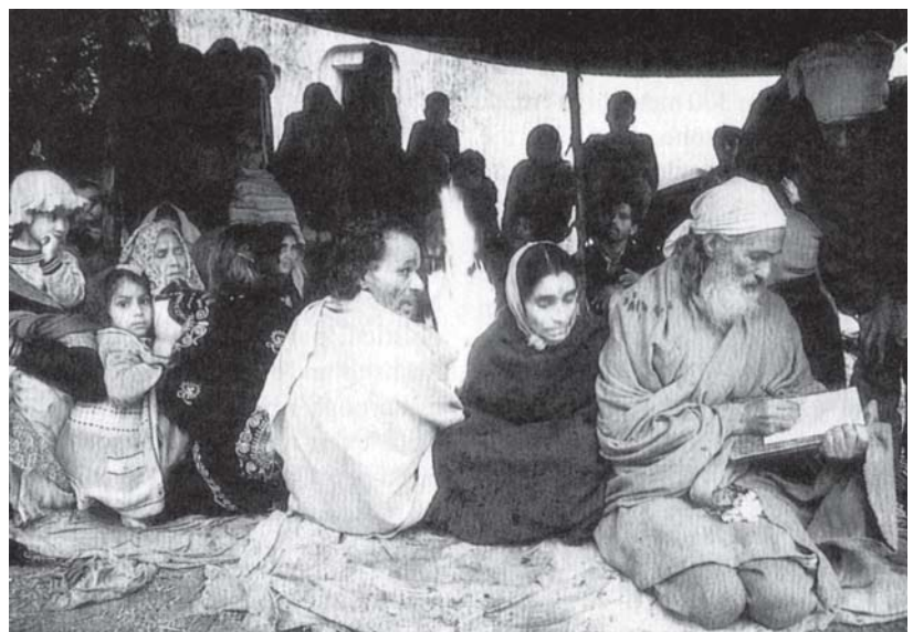
Sunderlal Bahuguna camping at the dame site

The people of Tehri have been paying a heavy price for resisting this dam for more than two decades now. They are now worn out and demoralised from this long drawn out struggle because, despite their concerted efforts, their pleas are being ignored. Since the Planning Commission first sanctioned Tehri dam project in 1972, there has been continued resistance to the building of the project. As a result, work could start only in 1978, and that too, only by the government taking draconian, repressive measures. Armed police took over Tehri town and a large number of people were arrested and