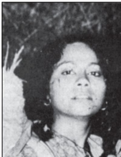
The filmi Phoolan