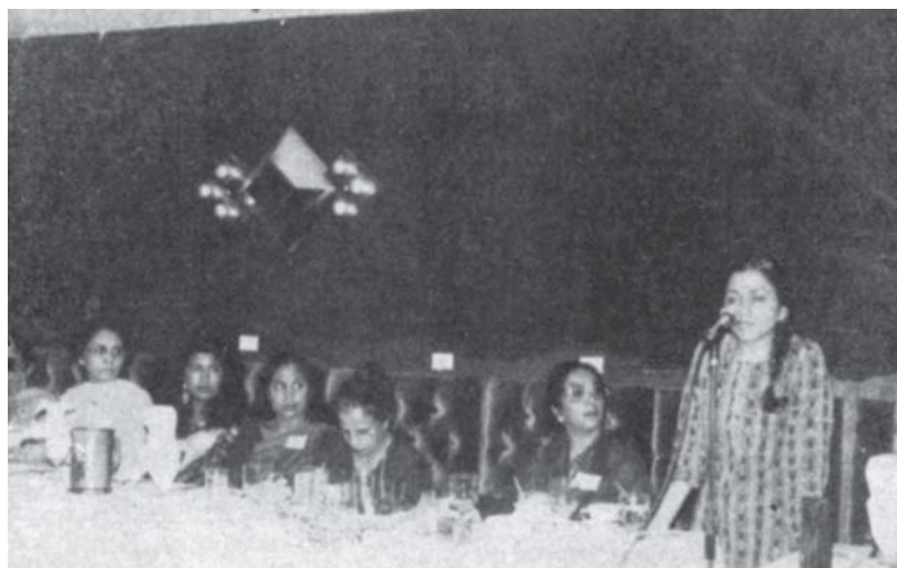
Representatives of various Indian communities in New York at a reception by Sikh Women's Organisation

There is also a distinction between supporting distinction between being a Khalistan and supporting terrorism or violence. Some combine the two positions.