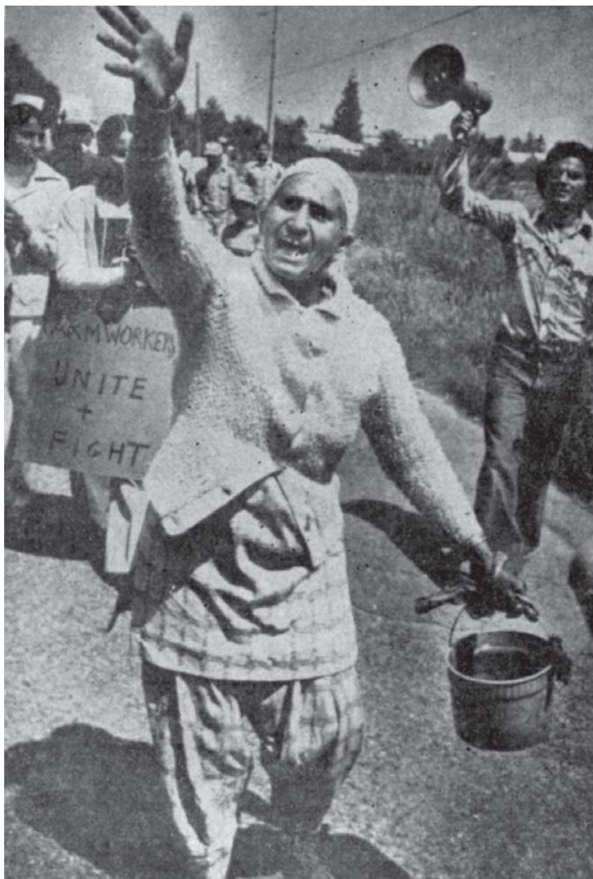
Sikh farmworker, Canada, in a protest demonstration : still from the award winning documentary :A Time to Rise" by Anand Patwardhan and Jim Monro

In the absence of a dialogue, and with the growth of the anti minority wave in