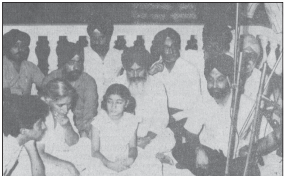
At the meeting

This has far reaching consequences. It creates a culture of total cynicism and demoralisation in ordinary people about the possibility of initiating any political or