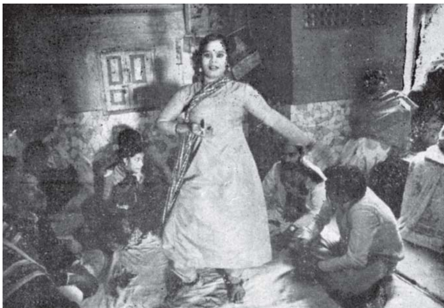
A woman dancing

The Bhartiya Patita Udhar is the first attempt by the G.B. Road women to assert themselves and to demand the rights due to them as Indian citizens. In the absence of any support from women's groups, it is difficult to imagine that their union will ever be an effective force. So far, all it has managed to do is write letters to the home minister, prime minister and the