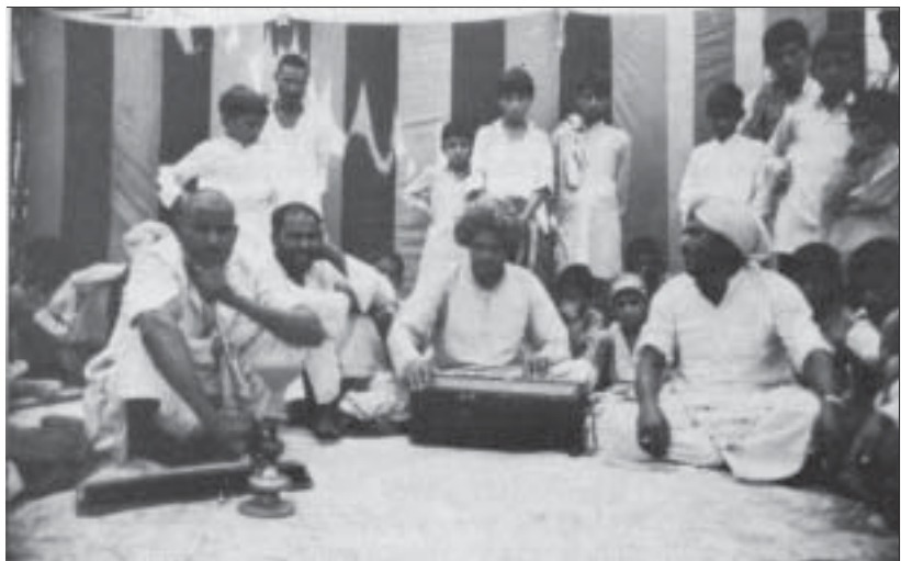
Meo Mirasis singing their own Mahabharata .

Social scientists continue to address questions of identity politics primarily through the framework of ethnicity. The binary construction of ethnicity is also characteristic of the theorists/ethnographers of violence whose understanding derives from confrontation, opposition, a world of