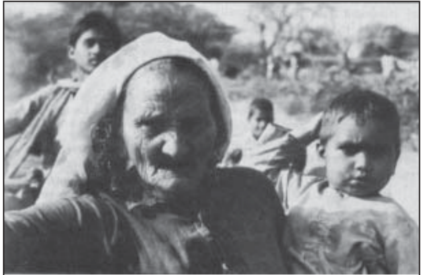
'I came back from Pakistan...'

Shankaracharya made an effort to reform and contain Shaivism. Some of the Shaiva schools were integrated into the dominant, brahmanical culture; others were marginalised like the Buddhists. Tantra survived outside the centre constituted by the