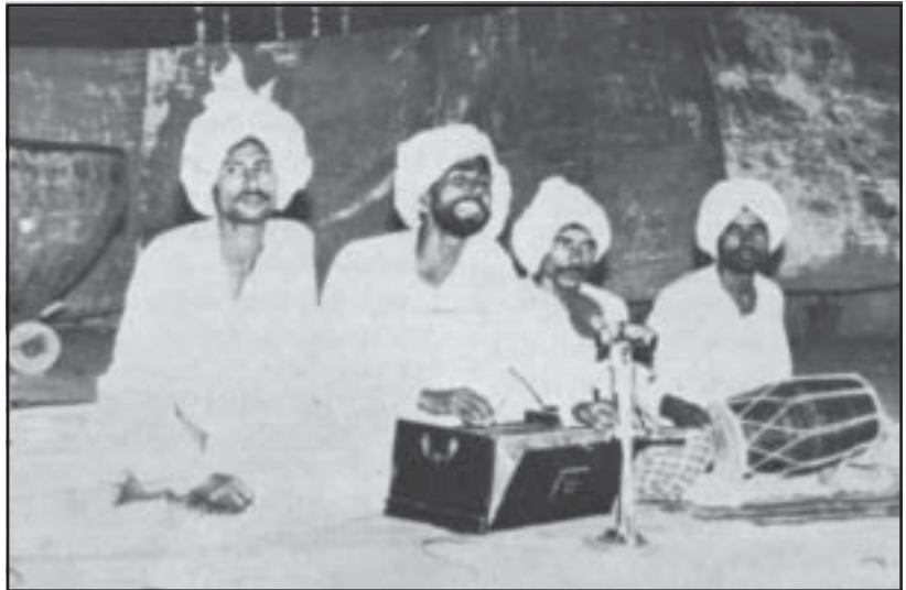
Mirasi singers performing at a wedding