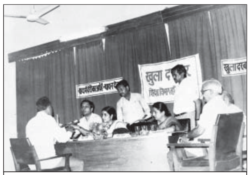
Holding an open court as Minister of Education in Haryana, 1987

My transfer policy was based on one simple consideration: how to place teachers in schools most convenient to them. For example, if a primary school teacher is posted to a school 40 kms from her house, it is bound to take a heavy toll on her health and peace of mind. In order to reach her school at 7 am, she has to get up at 5 am, cook, clean, get her children ready for their school then rush madly to catch her own bus. By the time she reaches school, she is already exhausted and irritable. In the evening she returns, even more tired to face more housework, children's and family demands. What kind of