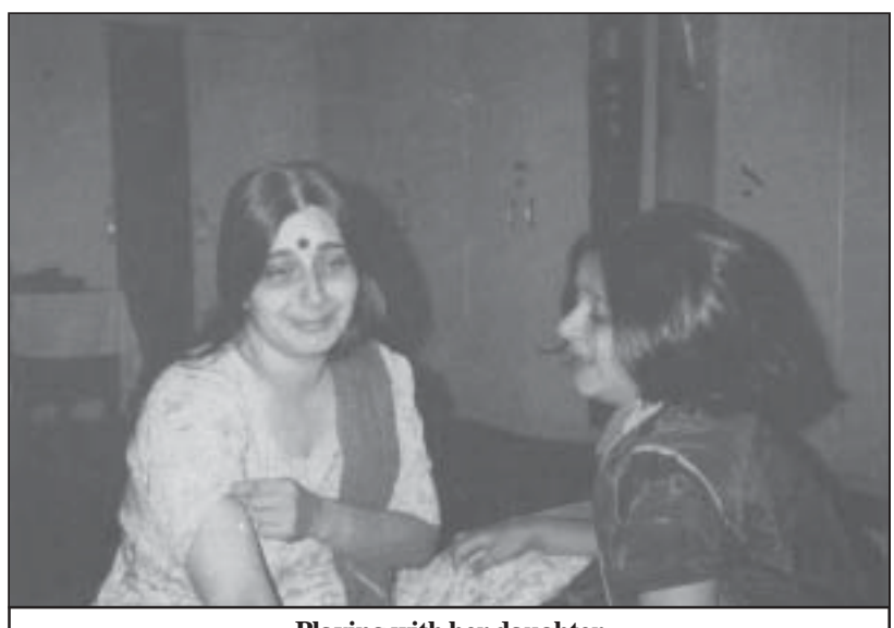
Playing with her daughter

An important aspect of the Indian way of life is to respect one's elders. This is ingrained in us from our birth. No matter how 'modern' we may become, we feel offended at seeing a child being rude to his or her parents. It is not part of our value system that a 12 or 15-year-old tells his parents: "This is my life. Who are you to interfere in it?" In the elite as well as in poor families, in 'modern' as well as traditional families, we like it when a person touches the feet of his elders, his dadi-dada, nani-nana. These modes of addressing near and dear ones, including neighbours in intimate familial terms, are an integral part of our culture. Similarly, the relationship between a husband and wife is treated as a sacrament. No doubt, divorce is now becoming common, but, we do not treat marriage as a mere contract.