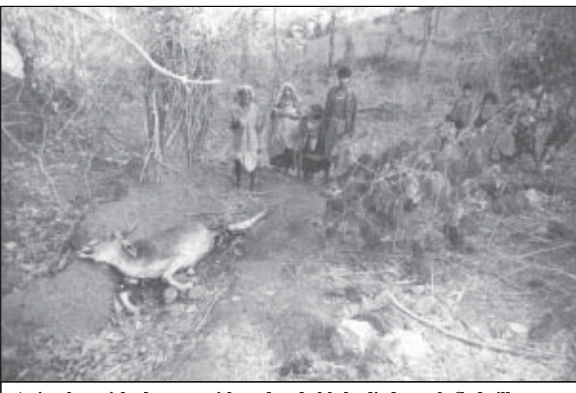
Animals perished, crops withered and able bodied people fled villages as even drinking water disappeared

Not one person in the rural administration could have failed to understand the consequences - that ground water had not been recharged and well levels were low; that tanks were not even a quarter full (agricultural economist and