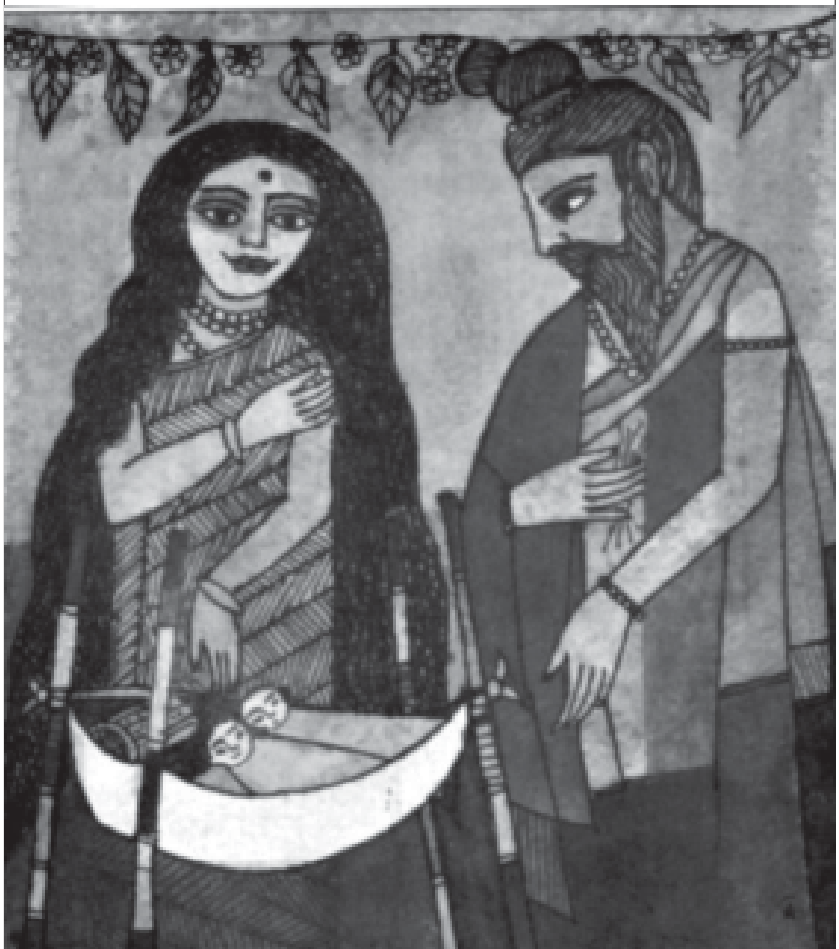
The abandoned Sita with her newborns in Balmiki's ashram

My interviews indicate that Indian women are not endorsing female sla-