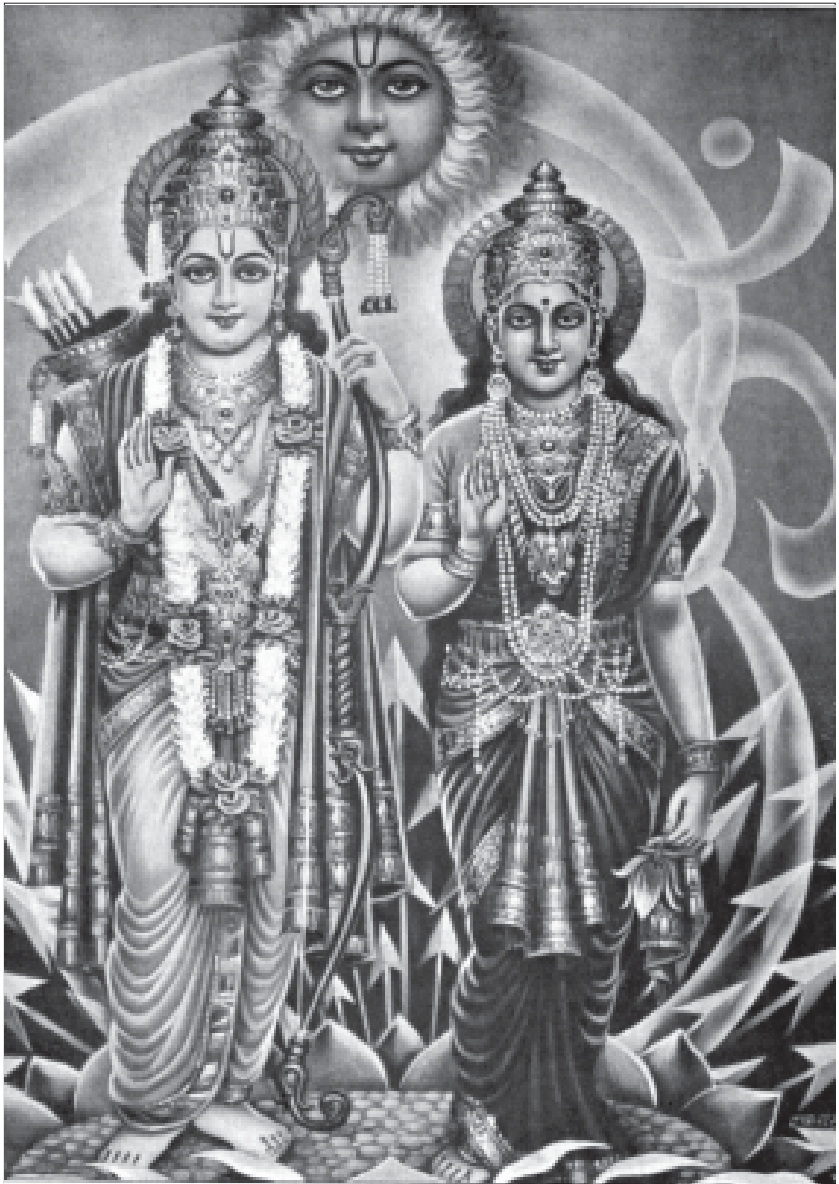
A modern calendar representation of Ram and Sita

Even among my students in the Delhi University college where I teach, Sita invariably crops up as their notion of an ideal woman. She is frequently the first choice if you ask someone to name a symbol of an ideal wife. When I ask women why they find this