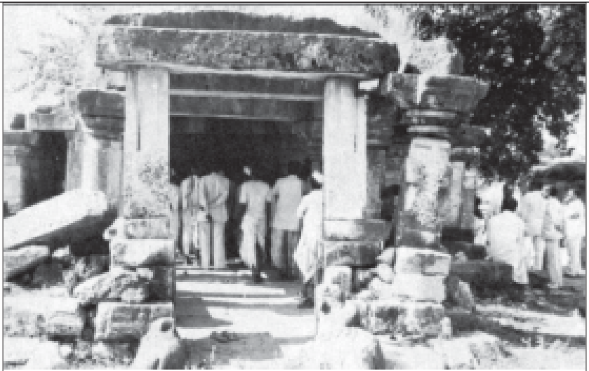
The ruins of Sita mandir, Yeotmal Distt, Maharashtra

as well. He suffered no less, and lived an ascetic life thereafter;