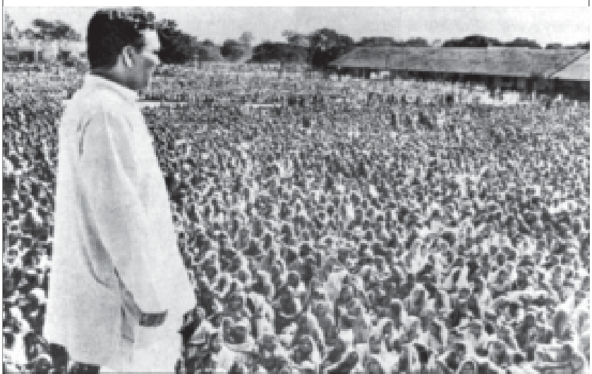
Sharad Joshi addressing a mammoth gathering of farmer women

He would conclude by saying that the purpose of the Lakshmi Mukti programme was to see that no modern day Sita would ever have to suffer the fate of Ram's Sita because she had nothing to call her own. By transferring land to their wives, they were paying off "a long overdue debt" to Sita mata. In village after village I would see men reduced to tears listening to the story of Sita. Hundreds of villages have already carried out the Lakshmi Mukti programme of land transfer to