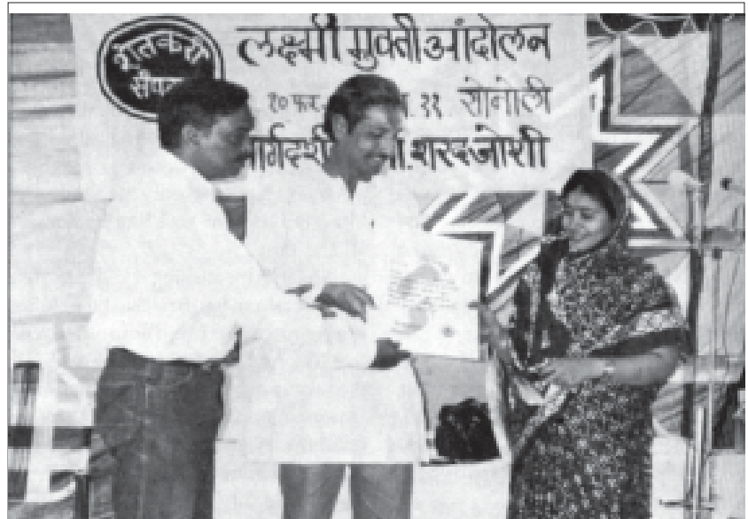
A couple being honoured with Lakshmi Mukti certificate, village Sonoli

back in the palace, but Sita insisted that wherever Ram goes, there goes Sita. She said, my place is by your side. She suffered numerous privations for him joyfully. Finally Ravan abducts Sita for no fault of hers but to teach Ram a lesson for his misbehaviour with his sister. Though Ravan respected her chastity and did not violate Sita, her own husband subjected her to the cruel humiliation of agnipariksha to prove her chastity. Even fire could not touch her but on their return to his kingdom, at the mere hint of a