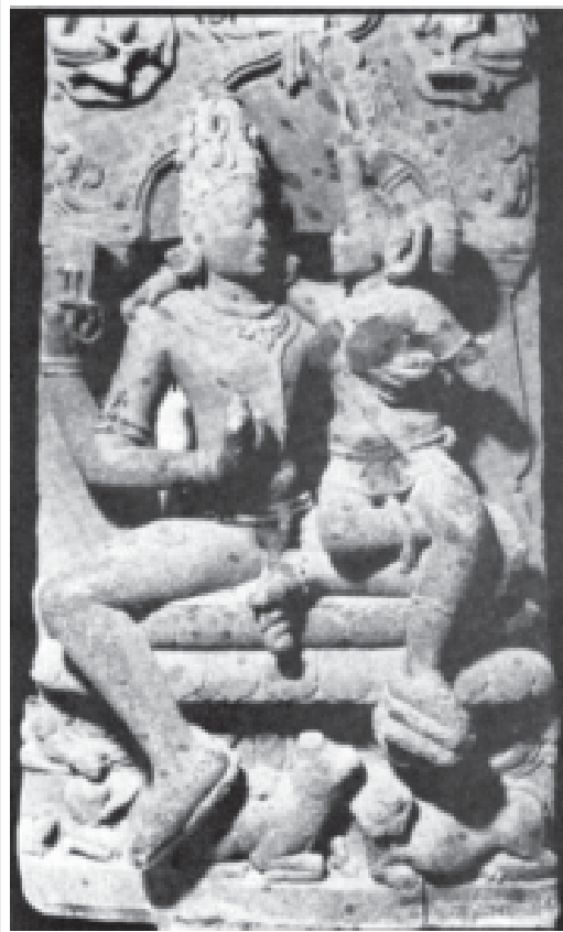
Uma-Mahesvara, Khiching Museum

While there has been a lot of discussion and analysis of the demands put on women in the Hindu tradition, the sacrifices expected of ideal wives, we have failed to evaluate the demands put on an ideal husband. The Hindu tradition might valourise wives who put up with tyrannical husbands gracefully but it does not valourise unreasonable husbands. On the contrary, it places heavy demands on them and