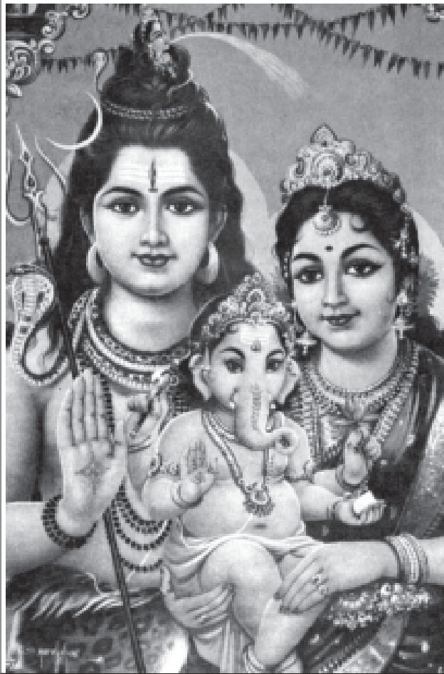
A modern calendar representation of Shiv and Parvati

Even in the rest of India, very few people endorse Ram's behaviour towards Sita. He has not been forgiven this injustice through all these centuries, despite his being a revered figure in most other ways. In this context, I am reminded of the time when Ramanand Sagar's Ramayan was being telecast over Doordarshan. As the story began approaching the point when Sita was supposed to undergo her agnipariksha the serial makers