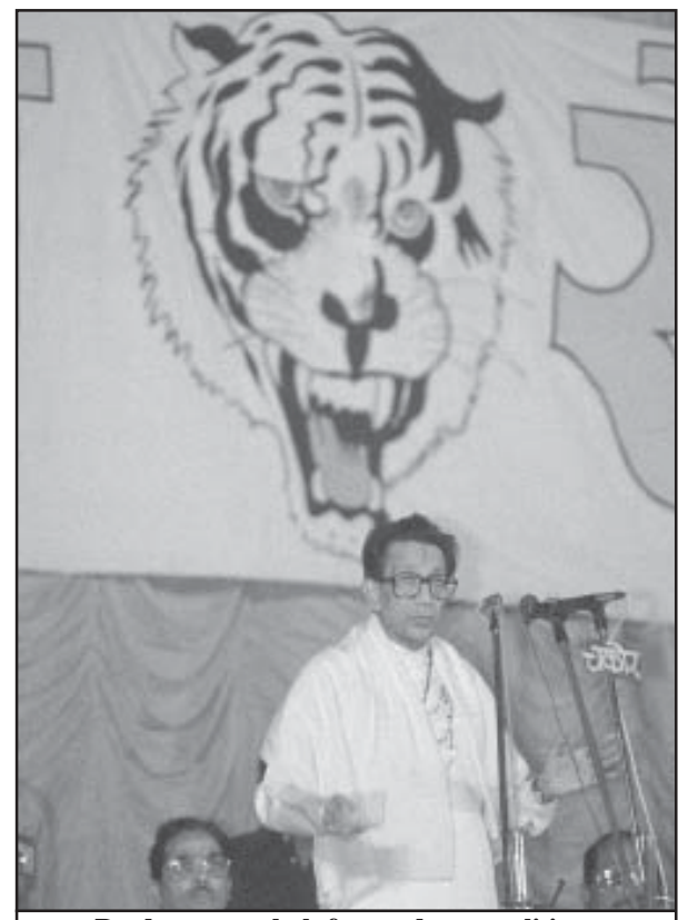
Predatory symbols for predatory politics : A roaring tiger is Shiv Sena's trademark

The Shiv Sena certainly did not fill a void but competed with various alternative providers of services like local self-help groups, NGOs, local gangs, political parties, all addressing the management of everyday affairs of work and living, housing and infrastructure, welfare and education, conflict mediation and associability, and supplementing the local state. In the competition for clients and territory, important for political clout and revenue respectively, the Sena has engaged in various activities and often brought about short-term results. Presented as a critique of paternal modes of governance, these shortterm, spectacular results that often later fail but are direct and immediately responsive to needs, suggest an explicit alternative to bureaucratic organisation, an explicit rebuff to legitimacy through procedure, an explicit rebuff also to the norms of the Indian state and its Nehruvian idea of a