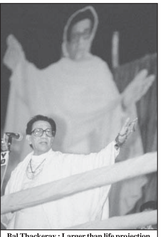
Bal Thackeray: Larger than life projection

switched its electoral allegiance from the Congress to the Shiv Sena because the local shakha pramukh [leader of local branch] had promised to solve their problem regarding a water connection. In the nearby zhopadpatt (slum cluster), people hoped for some more toilets; and elsewhere it was the protection enjoyed against some builders that was traded against votes. Such deals are commonplace. Most parties have practised them for many years but there are many people who attested that the Shiv Sena actually delivers. A mill worker commented: "With the Shiv Sena we can solve problems. They were the first ones to bring water pipes. They did it in five years. I don't know where the money came from. The roads were so bad that you would fall