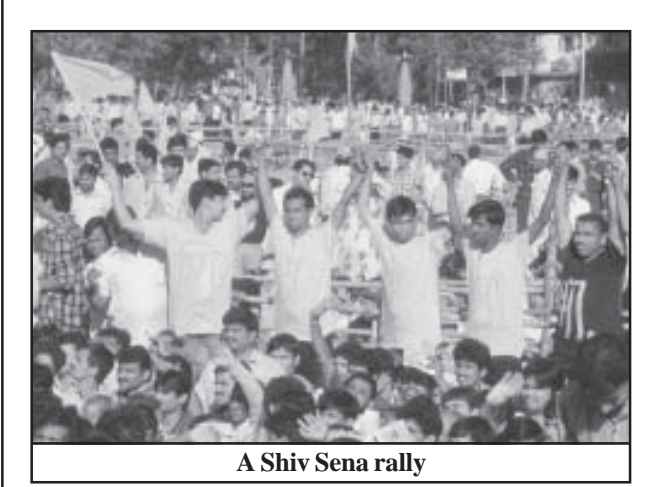
1995) or the identity politics inherent in the Sena's rabid communalism and the concurrent construction of the clearly defined "in-group" identity. It also derives from the daily participation in the activities of the Sena, which potentially encompass and reshape the whole social reality of those involved with the movement. This also distinguishes the Sena from the Congress party, the one rival with an equally encompassing local network, and machinery that provides equal, or even superior, patronage.