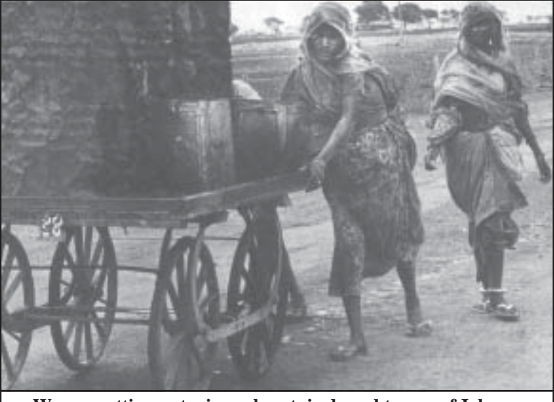
Women getting water in pushcarts in drought areas of Jalgaon

According to the rules, Block Development Officers (BDOs) can only sanction Rs. 5,000 to each village for water schemes, and this is not enough either to dig the well deeper or for repairs. In most of the villages, the water scheme funds provided by the government are not used effectively for that purpose and people have to make do with whatever water they can obtain, either from farmers' wells or by trying to bore wells deeper, if there is any possibility left for these methods. For two years, the monsoon has failed.