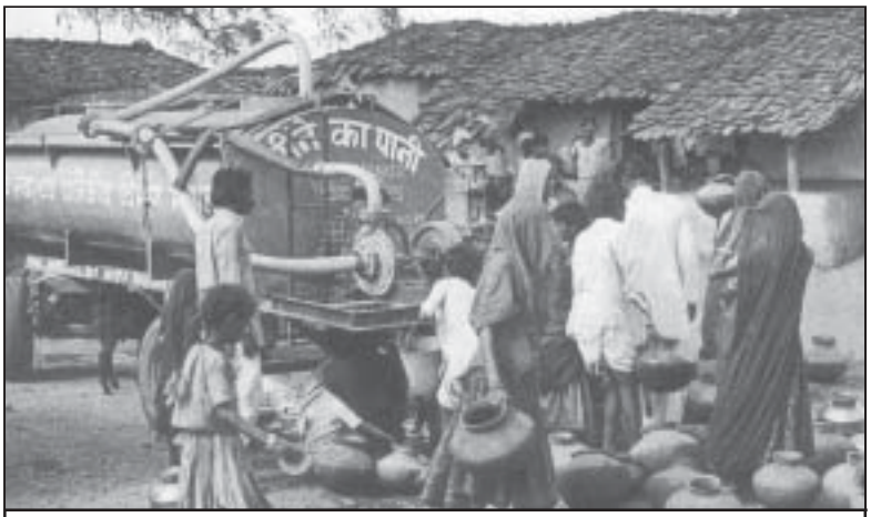
Tankers supplying water: familiar scene in rural India

In another example, in Dahiwadi, the district headquarters of the taluka , water is supplied only once every six days to the village. There is a tank near Dahiwadi which was built to supply water for irrigation. Water is available in the tank, but there is no mechanism for lifting it, and no jack well from which it can be lifted and supplied for drinking. This is another horrendous example of how badly government schemes are implemented. As a result, even the money that the government allocates for drinking water is not