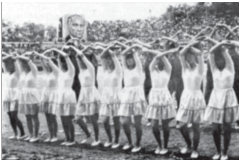
Young girls participating in a sports festival: a marker of Republican modernity

Yes, Nationalist ideologies are based on purification of race, language and history, so that was one of the major components. The written language changed from Arabic to The Latin script. There was a Turkification of language purging it of its Persian and Arabic influences. We witnessed a combination of nationalism on the one hand, and western oriented nationa-