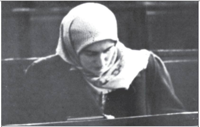
Overcoming the educational barriers

Apart from the women's project, there was also a transition from a multi-ethnic empire to a republican nation-state. The ideology of Turkish nationalism, compared to multi-ethnic Ottoman identity, emphasised a homo-