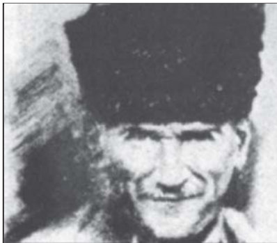
Mustapha Kemal Pasha

From the 1920s to 1950s many radical changes took place in Turkey. Ear-