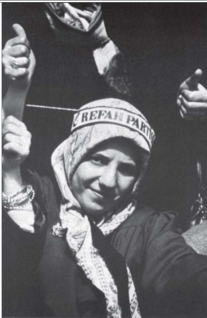
A member of the Refah Party

No, in Turkey the modernisation project was not so violent because unlike in Iran where they continued with the monarchical regime there was a rupture with the Ottoman aristocratic monarchical classes in Turkey because of the Kemalist reformers. The reformers were able to get closer to people. They were civil and military servants. Turkey has a very rich political experience, although it has been interrupted by military interventions, and a very rich democratic experience that Iranians didn't have. In Turkey, democratic institutions, political parties, civil society, social movements, pressure