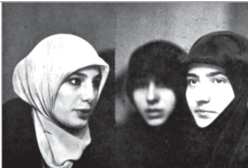
Islamic women students at the university

Exactly. But these radical Islamicist women are a small minority, not more than 10 per cent of the population. The