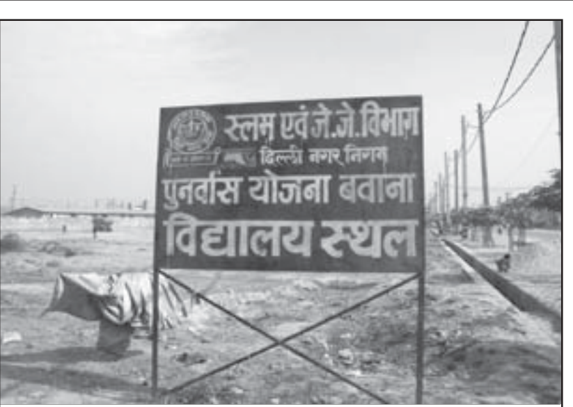
The board of the school stuck in an empty field after the demolition campaign

<sup>1</sup> 'The Yamuna Pushta Evictions. What happened to those who were not assigned plots?' Hazards Centre, December 2004