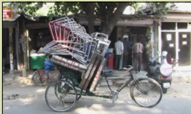
Inexpensive and convenient mode of carrying goods over short distances