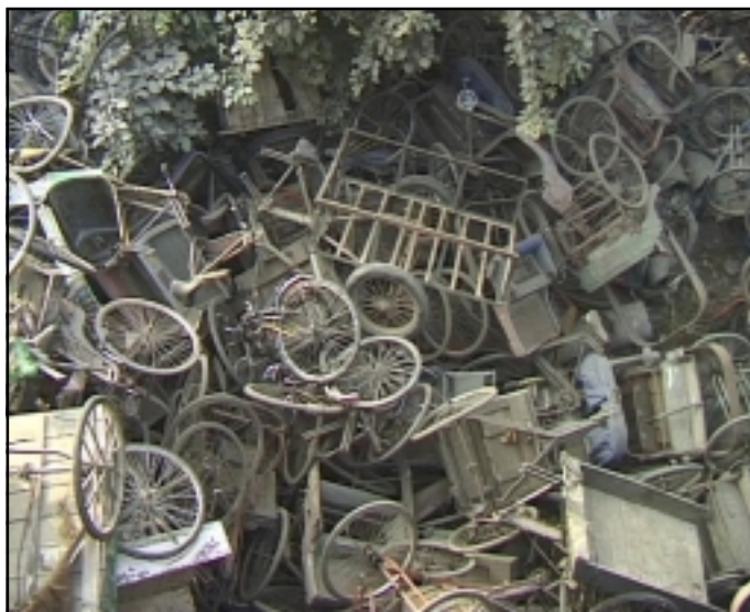
Thousands of confiscated rickshaws are junked as shown above in municipal yards in Delhi every year

However, in many urban centres of India one witnesses a steady deterioration in the technology and aesthetic appeal of cycle rickshaws during the last few decades. This is due to the fact that in these cities and especially in the capital city of Delhi, which has the most pompous pretension of wanting to develop into a “world class city” by emulating the alien and inappropriate models of development of First World cities, the existing