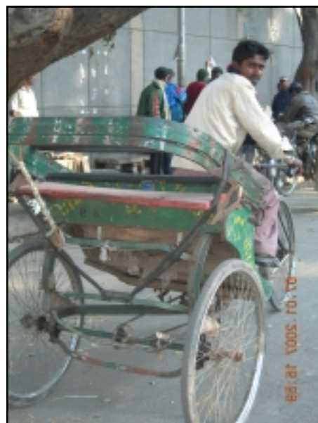
A typical dilapidated cycle rickshaw of Delhi today

In Delhi alone, lakhs of cycle rickshaws are confiscated every year under the guise of decongesting roads and checking unlicensed rickshaws. Nearly 60,000 rickshaws are junked and destroyed every year after confiscation on one flimsy pretext or another. Thus operating a cycle rickshaw has become a high-risk venture. With the threat of confiscation and destruction of the vehicle looming large, the operators have little incentive to invest money on its maintenance or introduce technological improvements. Under such circumstances, the creative urge to transform a humble vehicle into an object of art is effectively thwarted and even crushed.