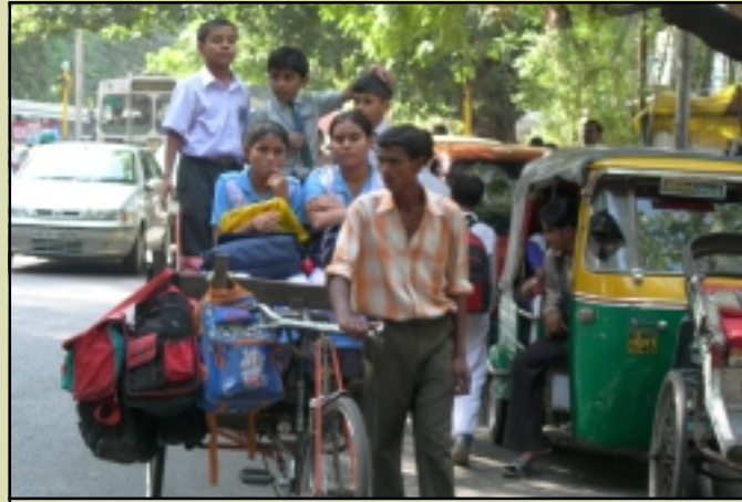
Safe, personalized doorstep transport service for school children