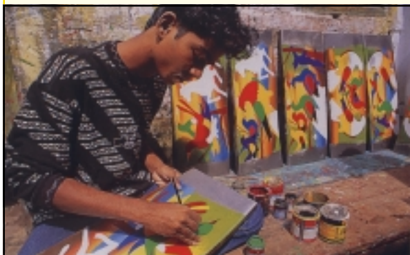
The hands that convert a humble vehicle into an object of art.

In cities and town where municipalities do not routinely confiscate and destroy cycle rickshaws, owners decorate every part of the vehicle with love and artistic flair