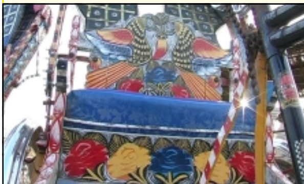
Rickshaw art in Allahabad