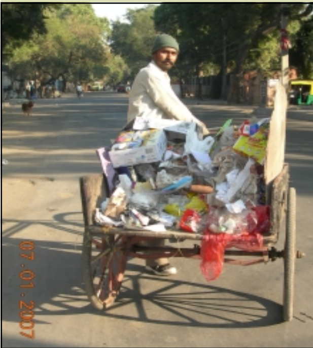
Low cost mode of garbage collection.