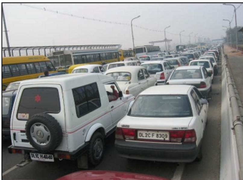
Traffic jams due to motorcars on multi lane flyovers where rickshaws are non existent are a common sight in Delhi

A car is an object of convenience for just the person or family that uses the vehicle. A rickshaw carries at least 50 persons a day and is constantly on the move. Therefore, it represents a much better utilization of road space.