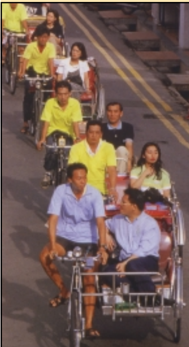
Singapore's cycle rickshaws are enjoying a new lease of life as a tourist attraction. Here the yellow shirt convoy of trishaws takes visitors through the aromatic streets of Singapore's Little India.