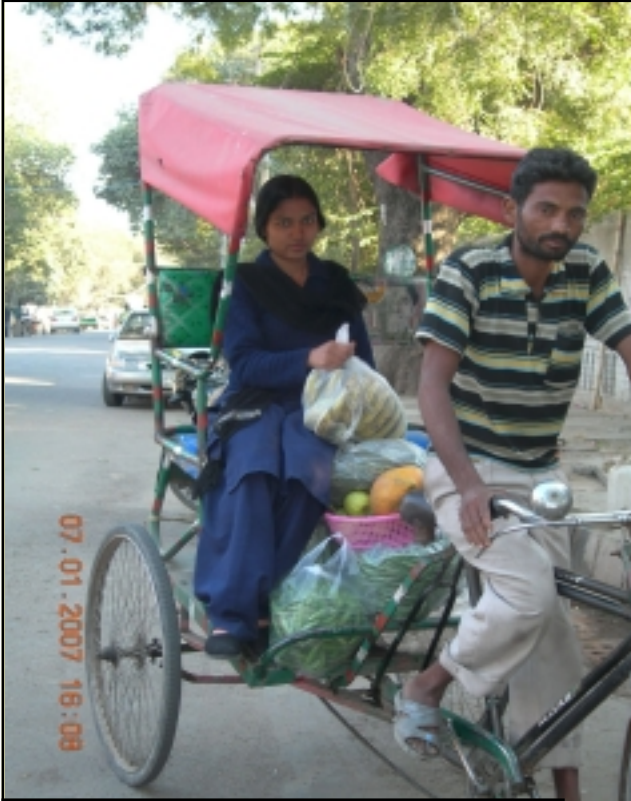
Inexpensive and convenient for daily shopping in local markets.