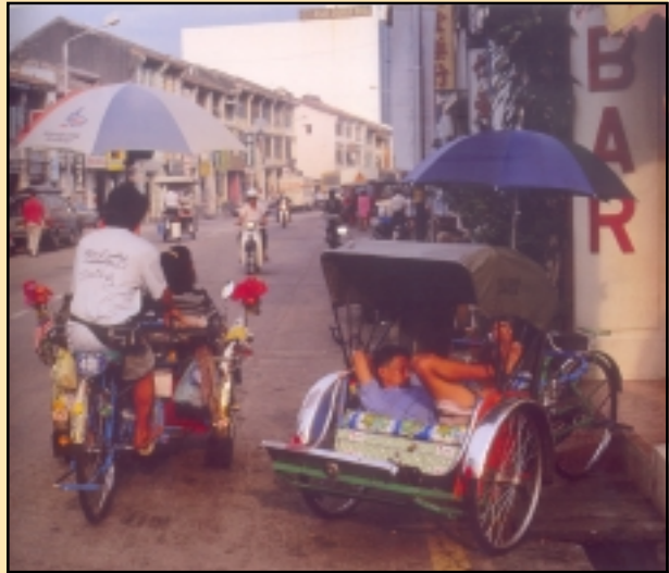
Trishaw in Georgetown