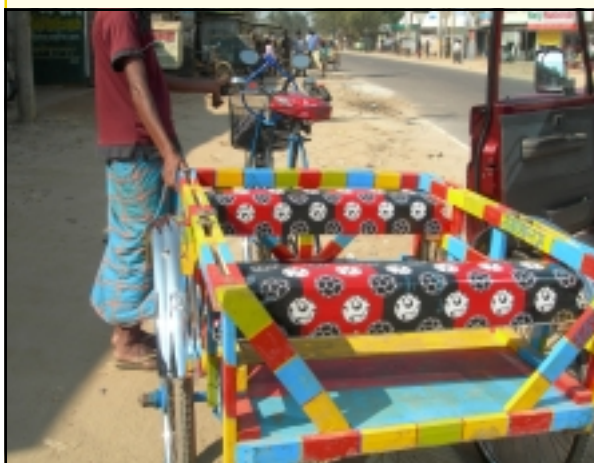
A typical trolley rickshaw for school children used in Bangladesh