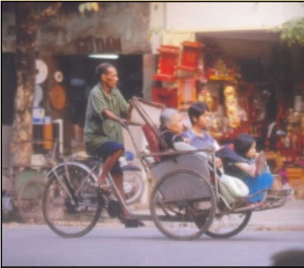
The puller pedals from behind in Hanoi's rickshaw