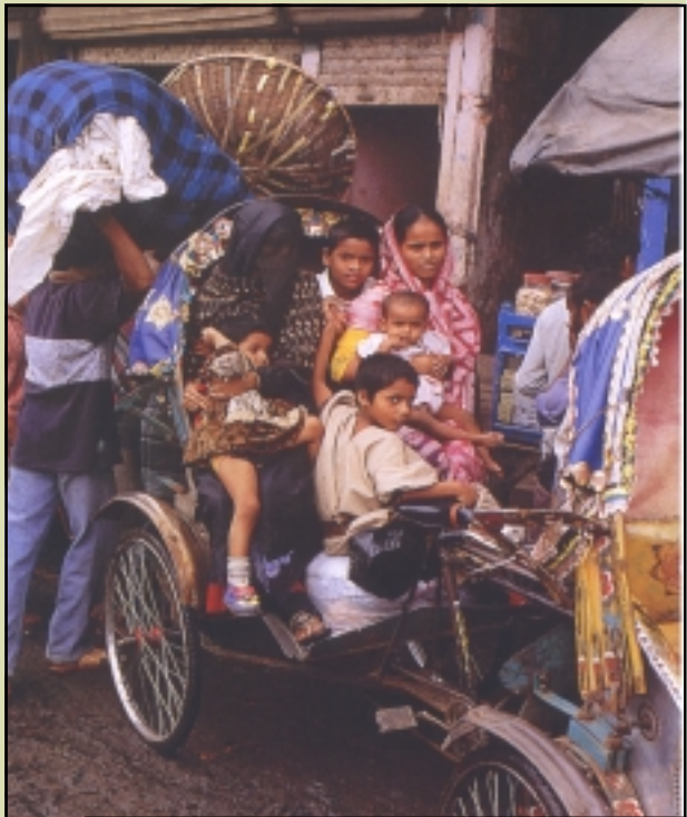
Inexpensive mode of travel for low income families