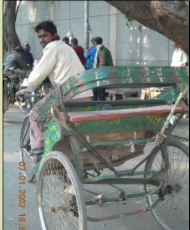
Instant source of livelihood for seasonal migrants from impoverished villages.