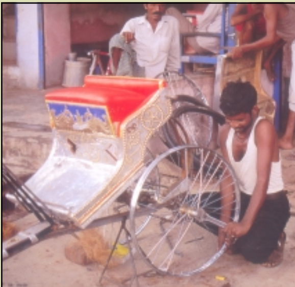
Generates employment in small-scale industry that produces rickshaw parts as well as a source of livelihood for lakhs of mechanics all over India who assemble and repair this vehicle.