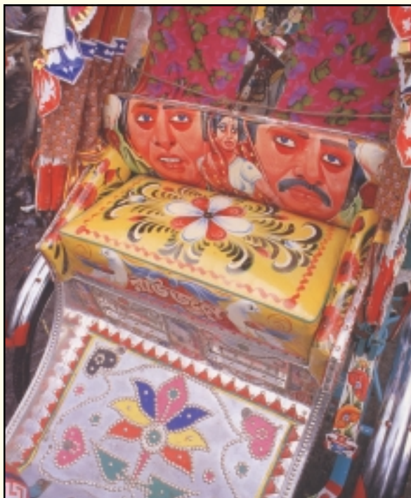
The seats for passengers and the space they use for resting their feet are lovingly decorated.