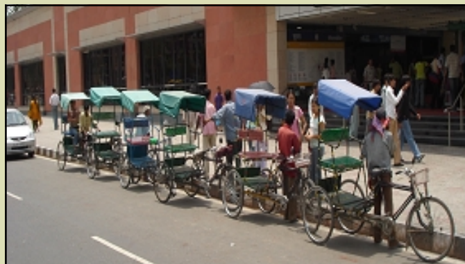
Feeder service for the Metro and bus stations: Rickshaws queued outside Metro station in Delhi