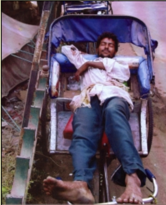
A resting place during the day and for many shelterless pullers the rickshaw becomes a bed at night.