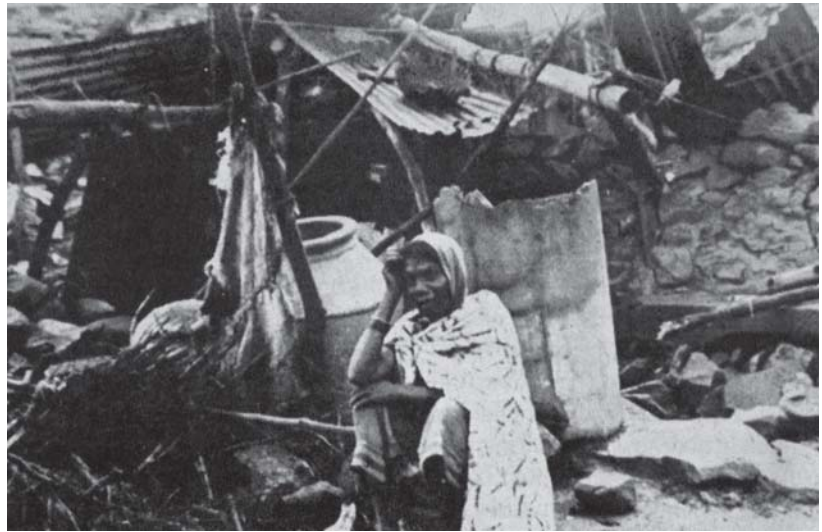
A grief-stricken woman, the lone survivor of her family, at Chicholi village in Latur district

Apart from these villages, several villages from Umarga, AUSA, Nilanga and Pandharpur talukas have also been affected by the earthquake. At several places, houses have developed cracks, men and women have been seriously injured, some have died. But the main feature of the tragedy is that people have been benumbed by shock. No deaths have been reported from the cities of Latur, Umarga, and Sholapur, but men and women are under extreme stress. They fear that they may meet the same fate as the people of Killari and Sastur.