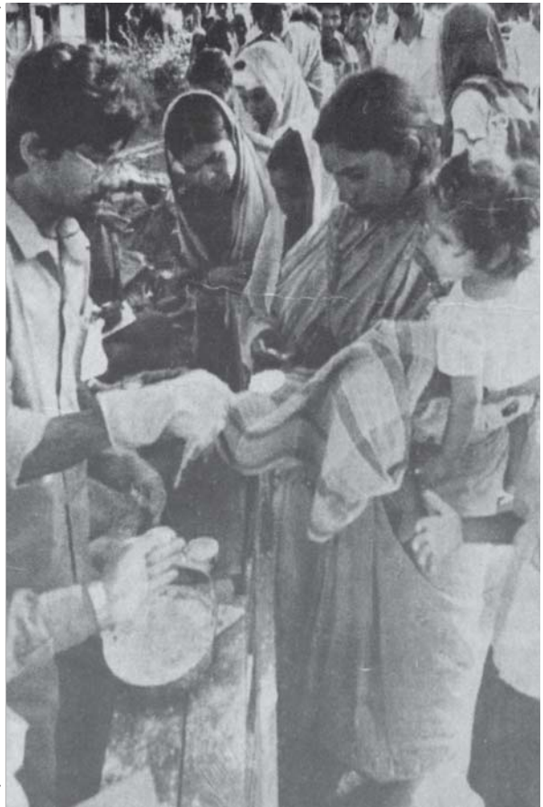
College students distribute food to earthquake survivors

Even if it is accepted as true that people were not ready to move, the government could at least have informed the people about the risks of living in houses that were not adequately designed to withstand earthquakes. Had the government built shockproof houses in these villages previously, the danger could have been averted. But in our country, we learn our lessons only after many lives have been lost. Living in houses