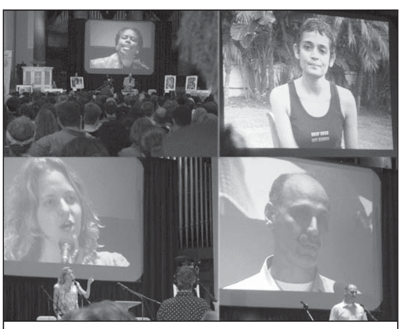
Larger-than-life images: playing to the global gallery

Similarly, the fouling of India's air and other natural resources took place long before India began inviting MNC capital. Poor people in large parts of the country have, for decades, been walking great distances to fetch pitiful supplies of water, so polluted as to be unfit even for animals. Those who breastbeat today about the contamination of our water sources by videshi MNCs, would do well to remember that all of us desis also allow the sewage from our toilets, and the wastes from the swadeshi petty production units situated in our city slums, to poison our river systems and ground water supplies. Desi pesticides, produced by