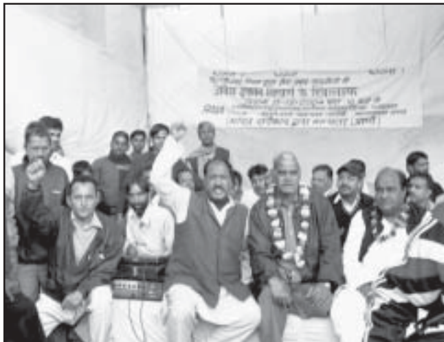
Local politicians sitting on dharna against the pilot project