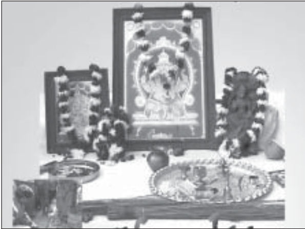
Jhadu pooja (broom worship) is a standard ritual in all Manushi Sangathan meetings. This picture of the first jhadu pooja performed on December 19, 2001.

self employment, they will be forced into destitution. If people routinely see the police and government officials extort money through coercion and blackmail, they lose respect for laws and in the process more and more tend to gravitate towards crime, making the lives of all of us unsafe. Without economic freedom, political freedom can be reduced to a ritual without much substance. That is why poorer citizens can be used as captive vote banks by those who exercise control over their livelihoods.