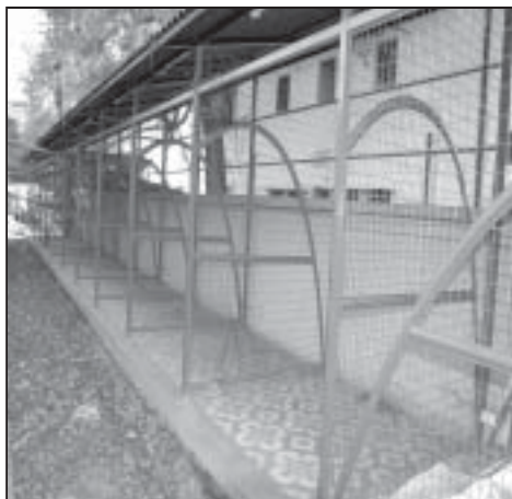
MANUSHI designed stalls under construction

The dharna against the project fizzled out because they could not get even 10 people to continue sitting there. Today, the tent put up at the site stands as a desolate but grim reminder that they could reassemble their forces and attack again. The