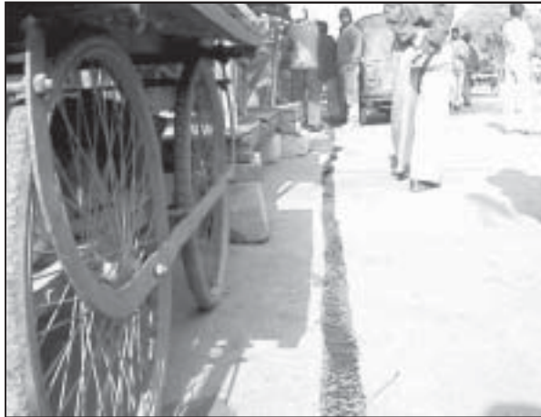
Both rehdis and stalls maintain discipline and stay within the sanyam rekha

rather than follow alien and inappropriate models of low populated Western countries. □ Combine aesthetics with optimum utilisation of space to encourage micro enterprises and self-employment rather than curb it through restrictive and unrealistic land use policies. Singapore and Tokyo have higher density populations than Delhi but they do not have oppressive and claustrophobic living and working conditions because they are well planned and well administered.