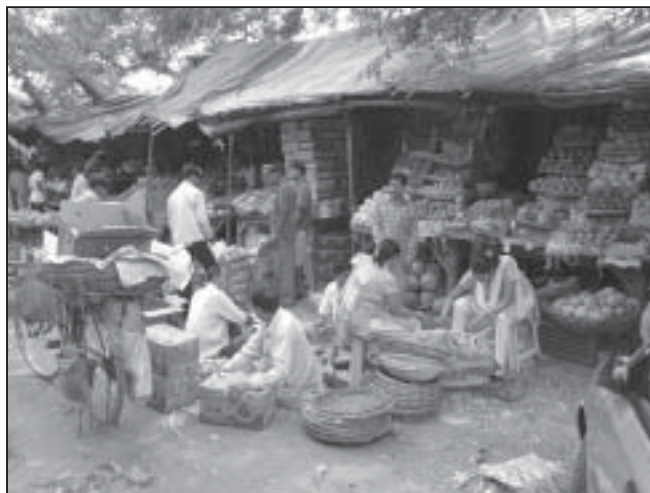
Typical squalor, indiscipline and takeover of road space by “influential” stall owners just outside the pilot project area

markets that come under our discipline) – including pavements, boundary walls, local parks and greening the area.