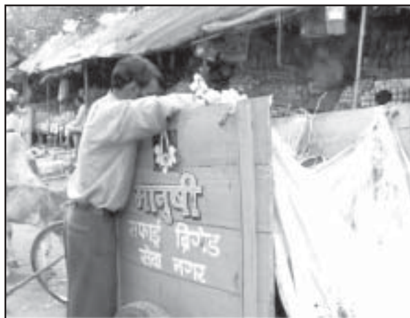
The Safai Brigade is managed and paid for by vendors

□ Provide a low cost, decentralized and highly efficient system of distribution: Hawkers distribute an incredible variety of products, at prices far lower than those prevailing in the established markets. Consumer prices of daily use essential commodities would rise dramatically if hawkers were to be eliminated from the urban centres, especially in a city like Delhi where property prices are incredibly high. Those who invest such phenomenal amounts of money in purchasing high price commercial space are not likely to sell low value and low profit goods like fruits and vegetables. Consequently the numbers of players in the market for the sale of such goods will decrease dramatically, removing competition, and consequently resulting in high prices for consumers. Street vendors keep prices low by working for incredibly long hours and keep their overhead costs low by involving family members in their operations. For example, a vegetable seller leaves home at 4 a.m., if not earlier, to reach the wholesale mandi by 5 a.m. By 7 a. m., he/she has carted the vegetables to his chosen spot, sorted out and