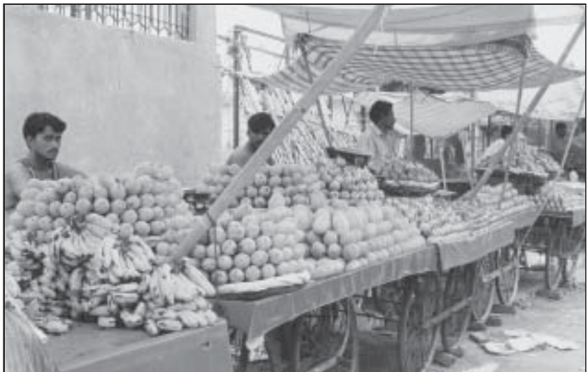
Uprooted vendors were back to business on June 14, 2002. How did this happen? Each vendor paid Rs. 2000 lumpsum to the bribe extractors who upped the monthly bribe rate by about Rs. 200. Today, they pay between Rs.1500-2000 per month as “protection money” and yet remain insecure.