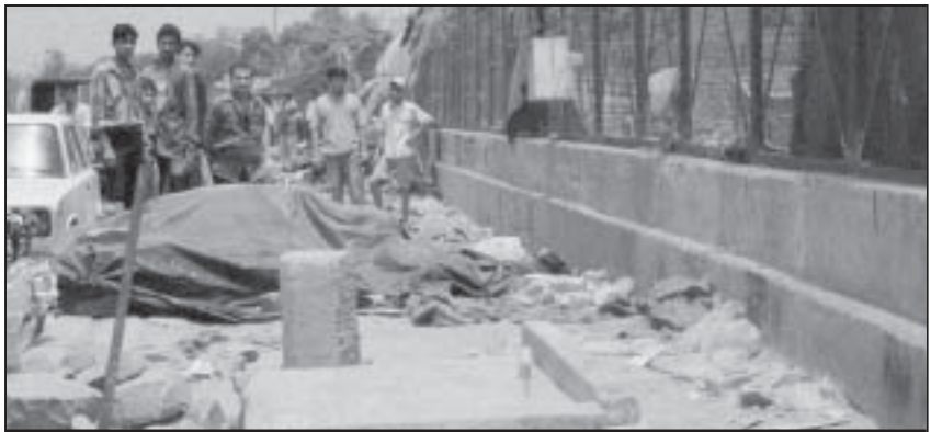
Municipal Corporation’s “Operation Ujaad” near Sewa Nagar, May 14, 2002

A major breakthrough came in May 2001 when we met the Central Vigilance Commissioner Mr. N. Vittal to seek his intervention in freeing the livelihoods of street vendors and rickshaw pullers from extortionist mafias. MANUSHI’s letter to the CVC shared the findings of MANUSHI that in Delhi alone these two groups of self employed poor are paying at least Rs. 50 crore per month by way of bribes to the police municipal agencies and local politicians. On the basis of MANUSHI’s complaint, the CVC sent letters to the Chief Minister of Delhi and various other high office holders demanding that laws and regulations with regard to these two sectors be changed.