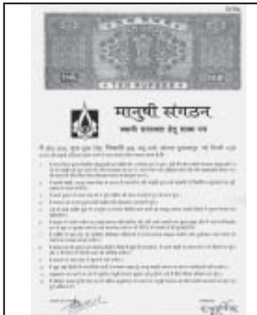
Shapath patra signed by each vendor promising to abide by agreed upon discipline

Throughout this period we faced repeated assaults by the local extortionist mafia because after MANUSHI succeeded in bringing a measure of security for the vendors and they began paying official rent or tehbazari fee, the vendors stopped paying bribes. This outraged the extortionist gang. They first tried blackmailing MANUSHI into giving each of them a certain number of stalls. When we refused to yield to their illegitimate demand they stopped the construction work by force and violence. On numerous occasions, our workers were roughed up and taken to the police station. Our architect and contractor were ordered to stop "illegal construction" or else face action. Our key members began