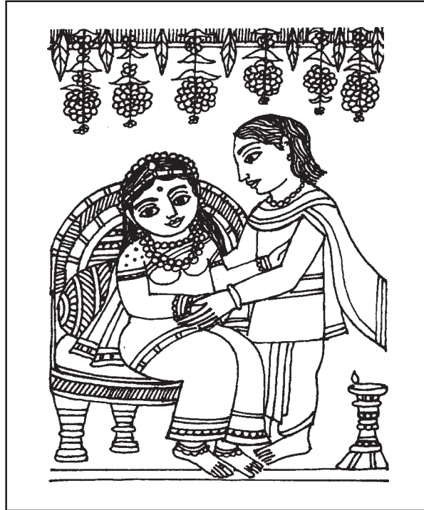
Illustration by BADRI NARAYAN, Courtesy: The Ramayana

protected 'the demonesses at the very time they were tormenting you, even when they did not ask for protection.