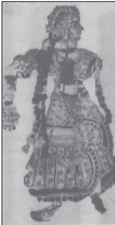
Shadow play puppet in leather, illustrating Sita; Andhra Pradesh, 19th century