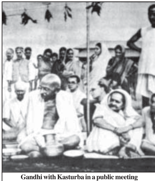
Gandhi with Kasturba in a public meeting

The relationship was never restored. However, after his father’s death, Harilal suddenly appeared in our home in New Delhi. My uncle would never say so himself, but my father concluded from the timing of his visit that he had come “to share our sorrows.” 10 Not long thereafter, Harilalkaka — Uncle Harilal — died. ‘Gandhi versus Gandhi’ is the title of a popular, and I understand moving, stage play in Marathi about Gandhi’s failed relationship with his eldest son.