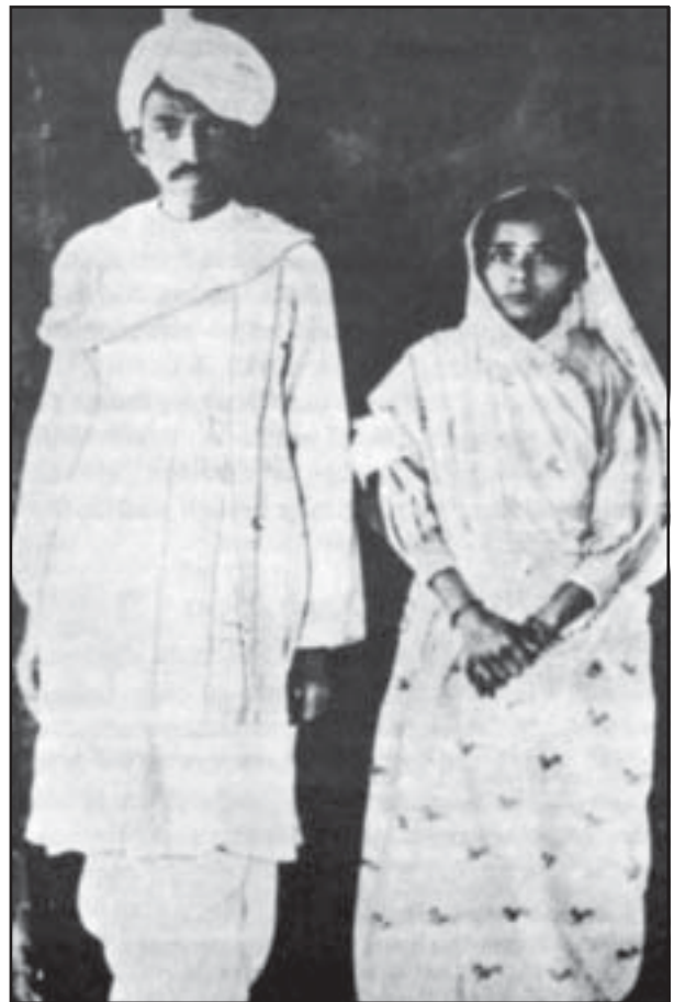
With Ba in their younger days